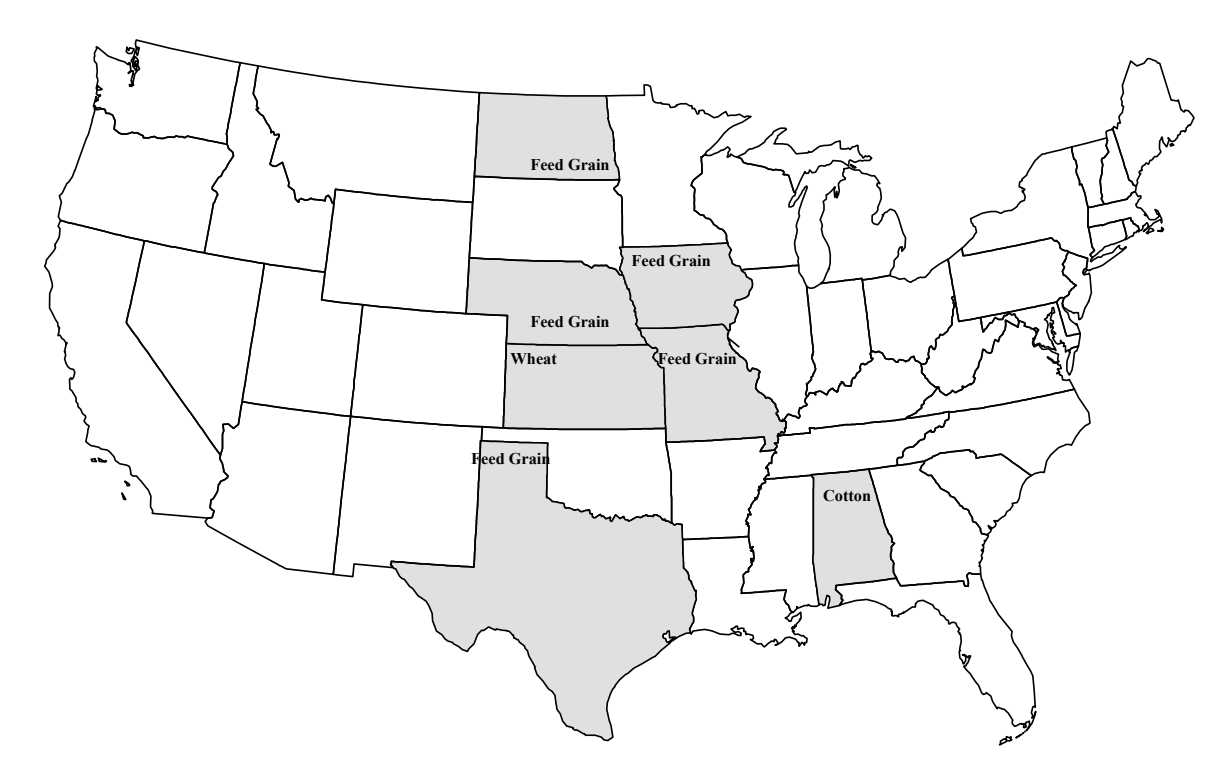
Figure 1. Locations of AFPC Representative Farms Utilized in Climate Project.

characterized by local features and resources to which the farm manager adapts. Local conditions are internalized in the creation and simulation of each farm.